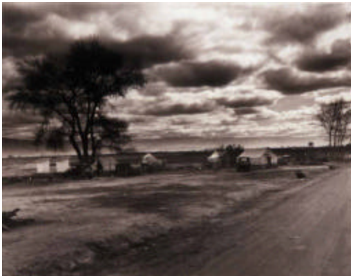
Dorothea Lange, Roadside Ranch Camp , 1936. Gelatin silver print. Santa Barbara Museum of Art, Museum purchase with funds provided by PhotoFutures.

Contact: Katrina Carl 805.884.6430 kcarl@sbma.net