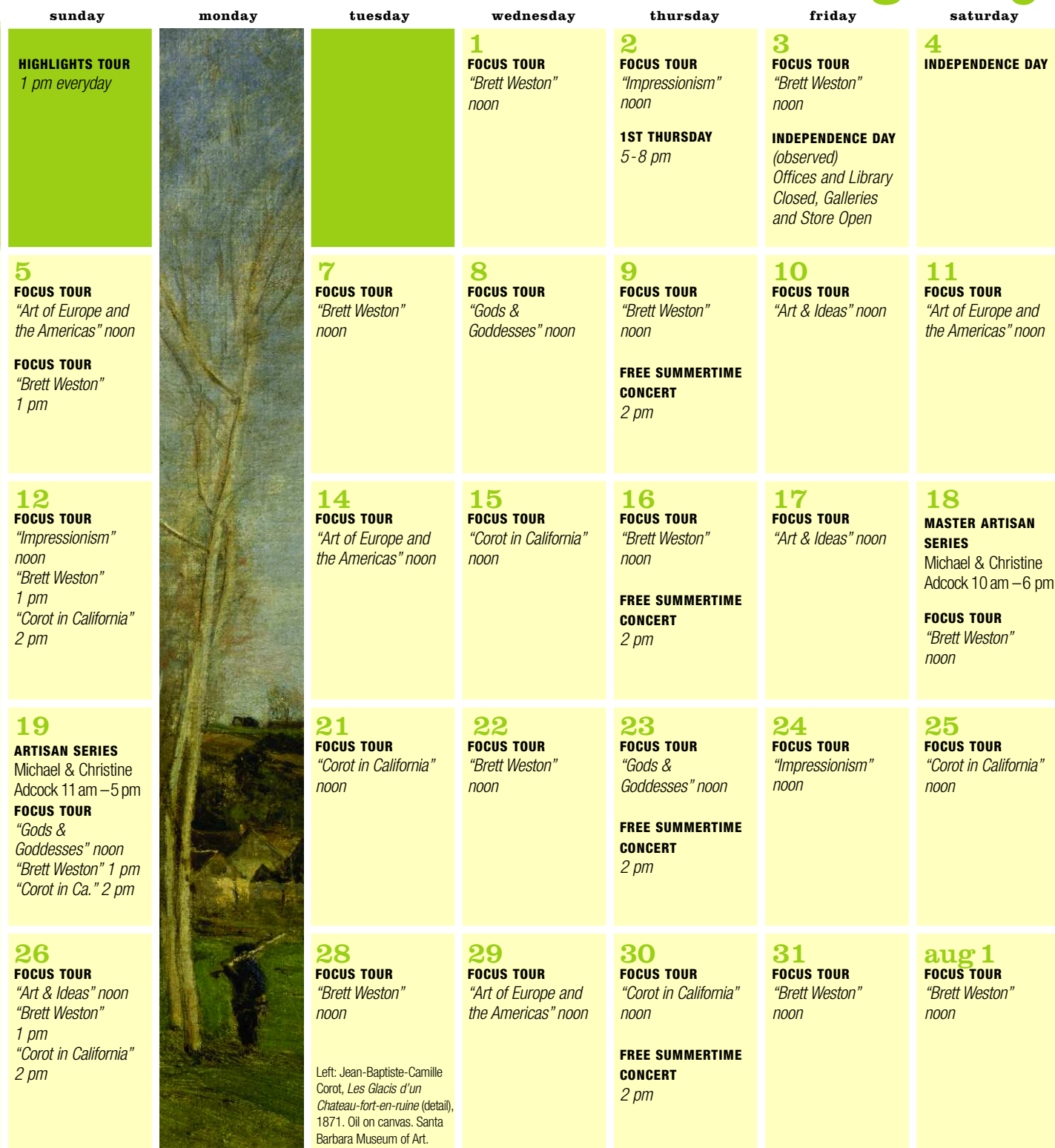
Left: Jean-Baptiste-Camille Corot, Les Glacis d'un Chateau-fort-en-ruine (detail), 1871. Oil on canvas. Santa Barbara Museum of Art.