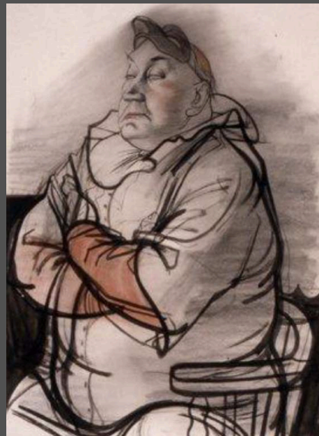
Rico Lebrun, born Italy, 1900; died United States, 1964. Seated Clown , 1941. Ink and wash. SBMA

Portraying Attitude and Emotion through Self-Portrait Poems